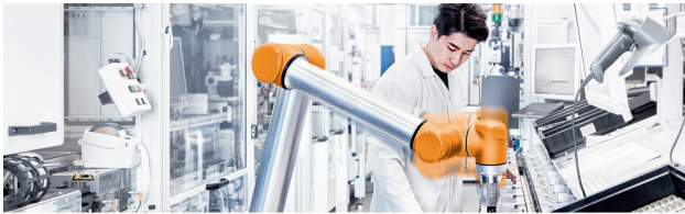
MOBILE ROBOTICS SEMINAR